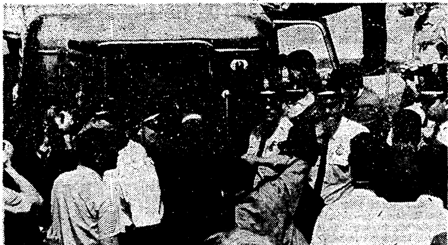
'FREEDOM RIDERS' ARE LOADED into a police van. Twelve were arrested Wednesday in Jackson, Miss., after they arrived and attempted to integrate facilities at a bus station. They were taken to the Jackson city jail.