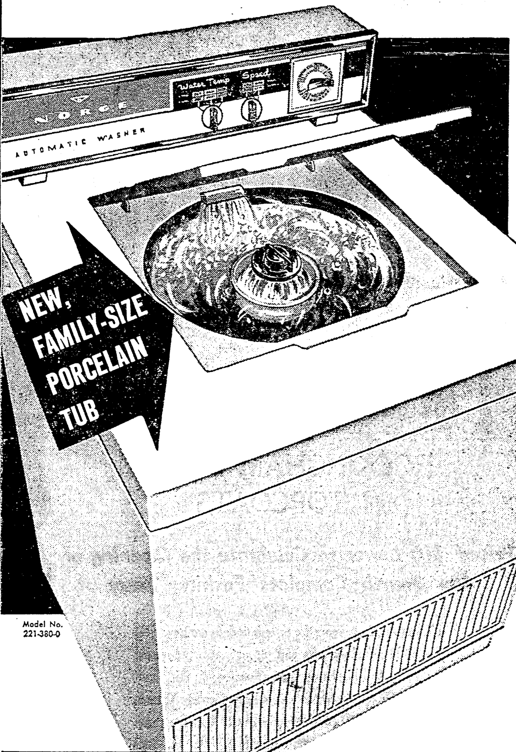
Model No. 221-380-0